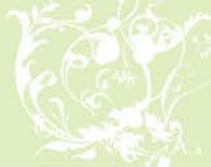
Photo Album Price List